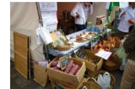
Vegetables direct from the farm