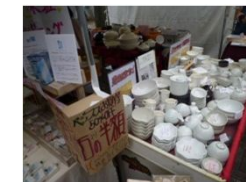
Goods and cosmetics