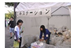
Garbage collection station